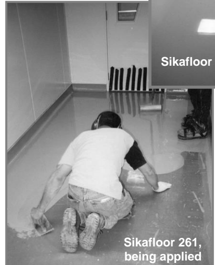
Sikafloor 261, being applied