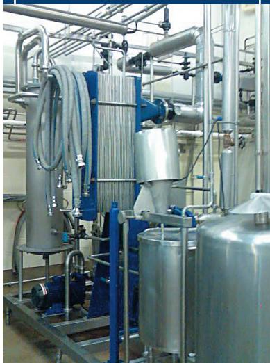
APV Junior Plate Evaporator