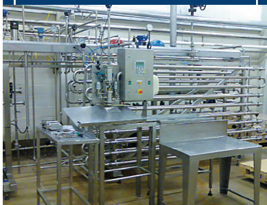
UHT Plant and Aseptic Filling Head